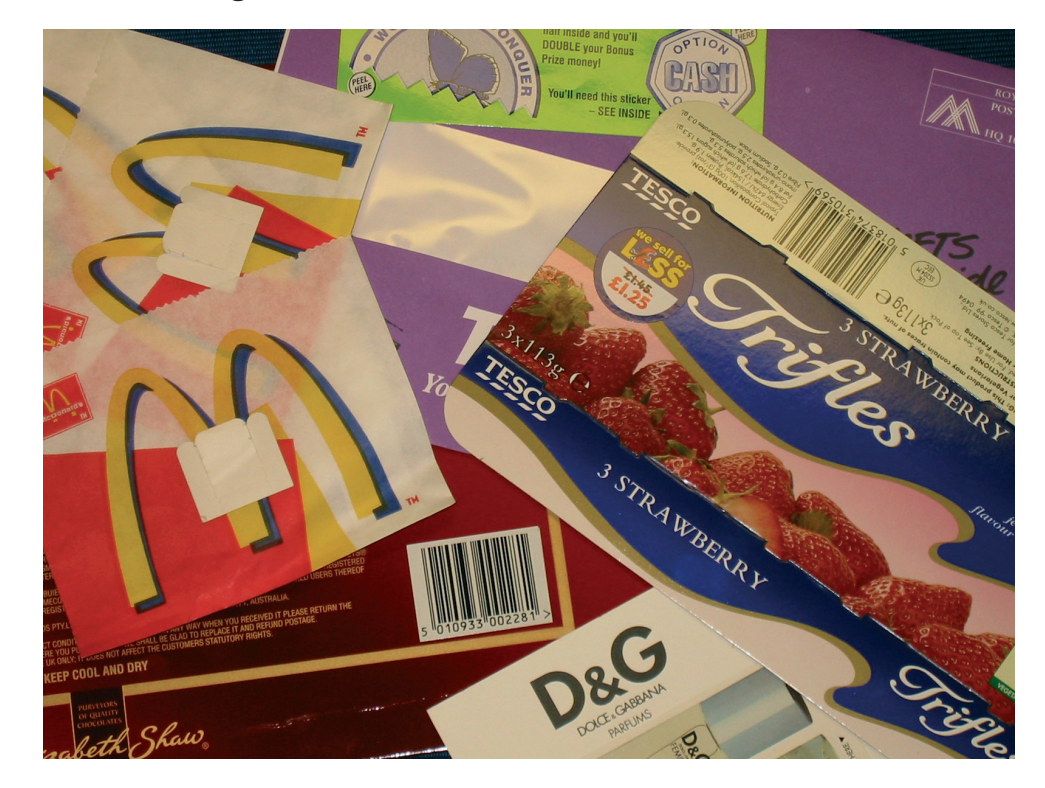
You supply the labels and the items - we'll apply them where you want! Quickly, accurately, economically...

We pride ourselves on meeting short lead-times with quick turn-arounds and our professional levels of service make us the perfect partner for extended marketing activities.